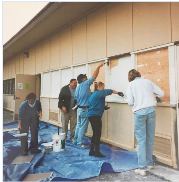
AGP volunteers paint the Sanchez Art Center, 1996.

Currently, 160 artists are AGP members and of those, 88 are represented in the 60th Annual Members Show, now through November 18 in the Center's East and West Galleries. The previous year's award winners are exhibiting in the Main Gallery.