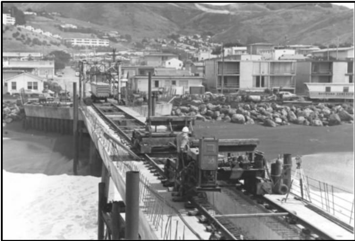
On March 20, 1973, employees of Healy Tibbitts Construction Co. of San Francisco work on the building of the City of Pacifica's Ocean Fishing Pier and Outfall.